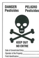
Restricted Entry Interval of more than 48 hours